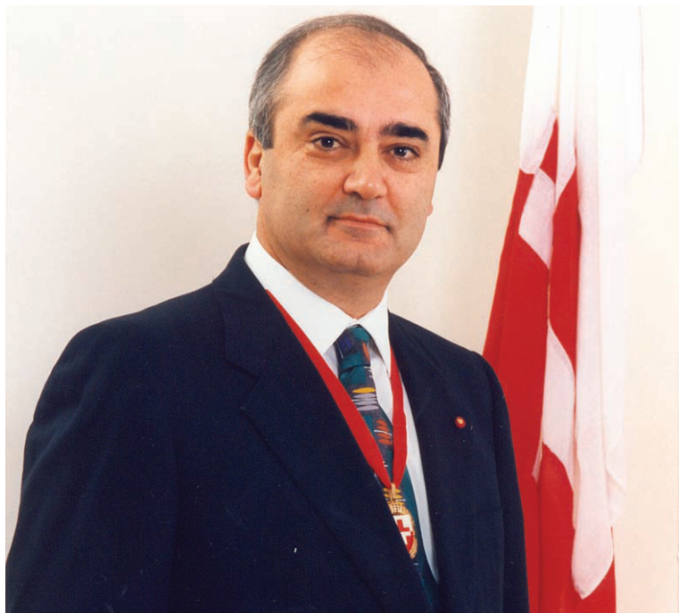
Angelo Xuereb appointed Mayor of Naxxar