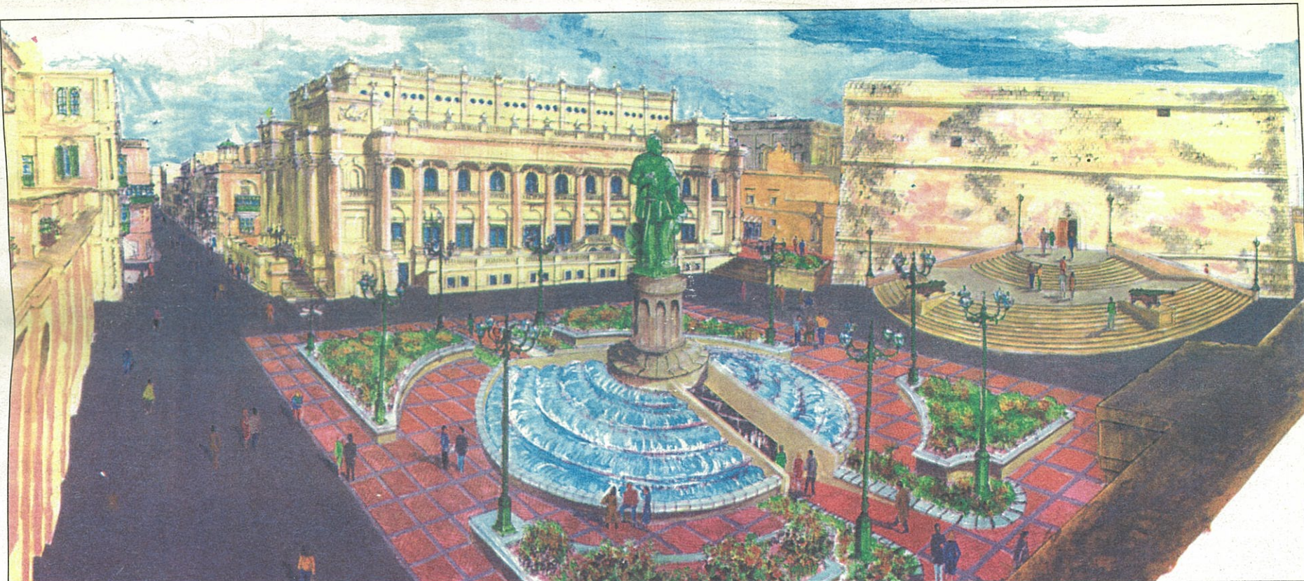
A DRAWING of Place de la Vallette's proposal to build the former opera house site to its original façade design, demolish the arcade to reveal the St James Cavalier fortification and the atrium beneath La Vallette's statue on Freedom Square